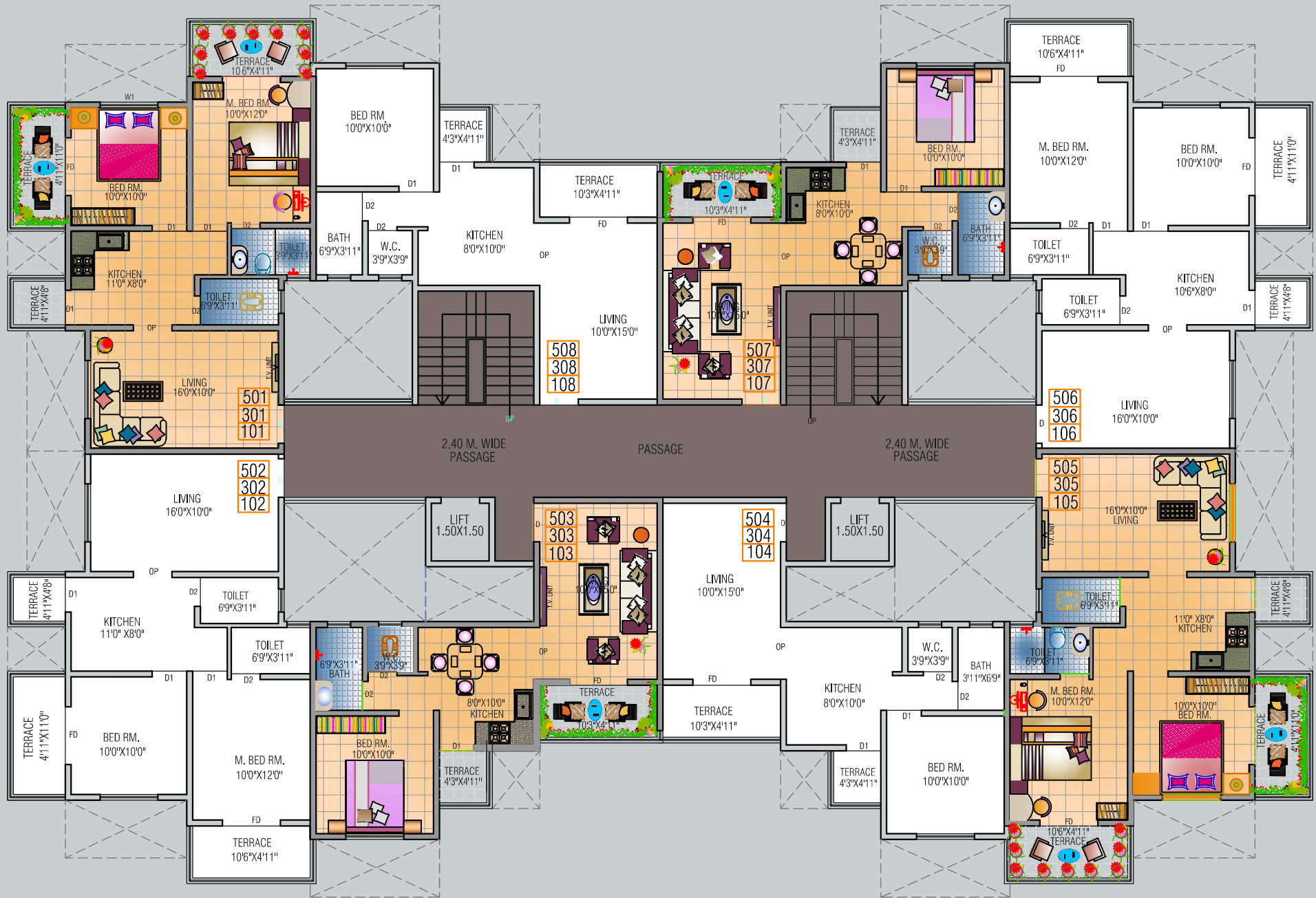
TYPICAL 1ST,3RD,5TH FLOOR PLAN